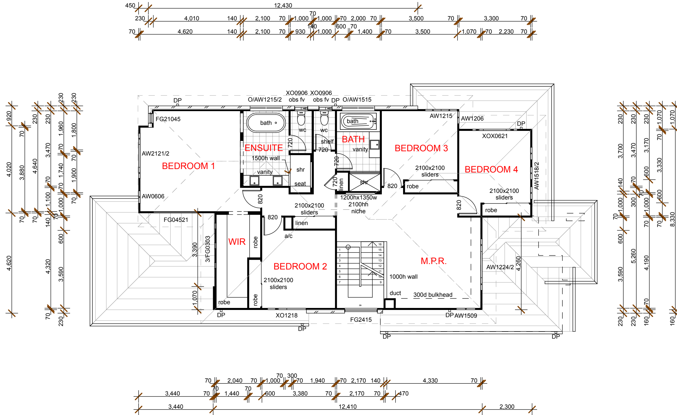
FIRST FLOOR PLAN SCALE 1:100